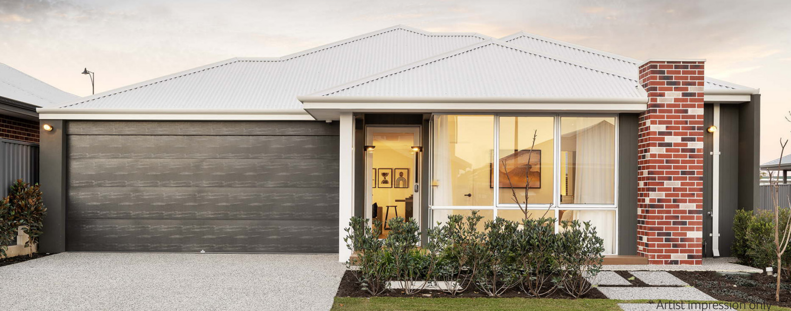
Artist impression only