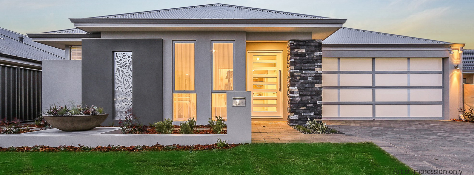
Artistic impression only