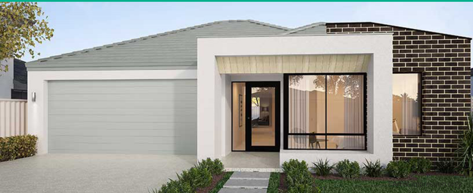
Artistic impression only