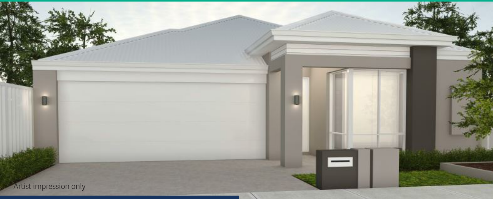
Artist impression only