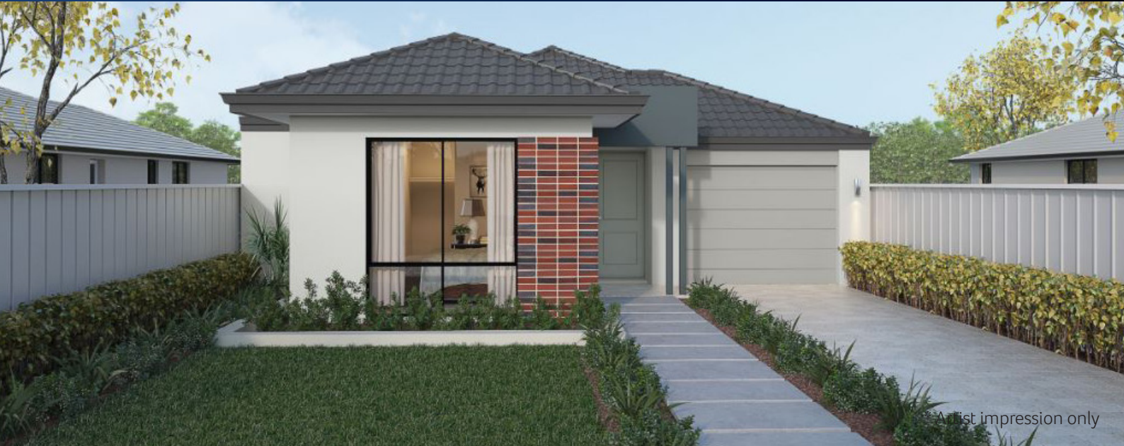
Artist impression only